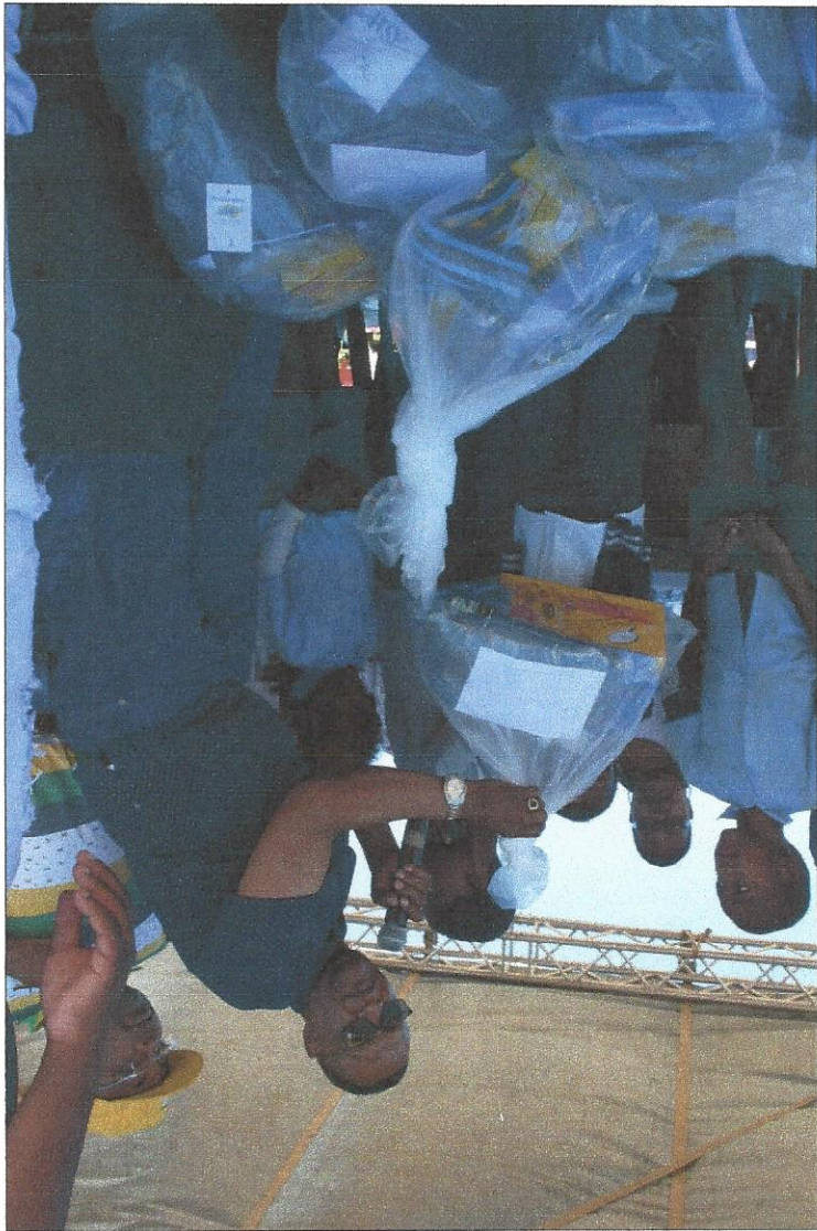
Capton ya Photo here

Nala Mayor, Councillor Theko Mogoje together with Nala Council recently embarked on a Mayoral Imbizo that saw the dispensation of food parcels to various day care centres. "We thank you on behalf of the parents of the children in your care" Nala Mayor, Cllr Theko Mogoje told various matrons of crèches across Kgotsong. The program further afforded school uniforms and sanitary towels to the disadvantaged pupils of Nala Municipality. In tow was the Department of Human Settlement and Home Affairs. Each department respectively provided their ser-