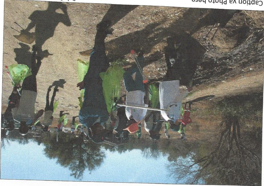
Caption ya Photo here

The Department of Water and Forestry in partnership with Nala Municipality, Sedibeng Water and Coca-Cola embarked on campaign to clean Vals River banks to give back to the community of Nala